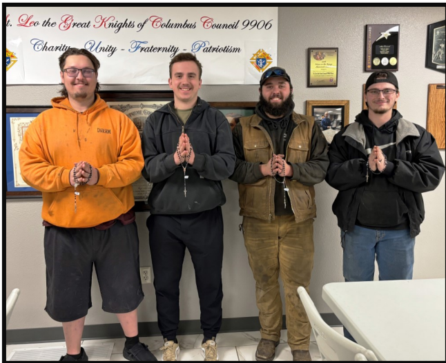
Four New Council 9906 Members

Although we didn't have a meeting on the 20th, we were able to initiate four new members into our council. Please take time to congratulate them when you get the opportunity.