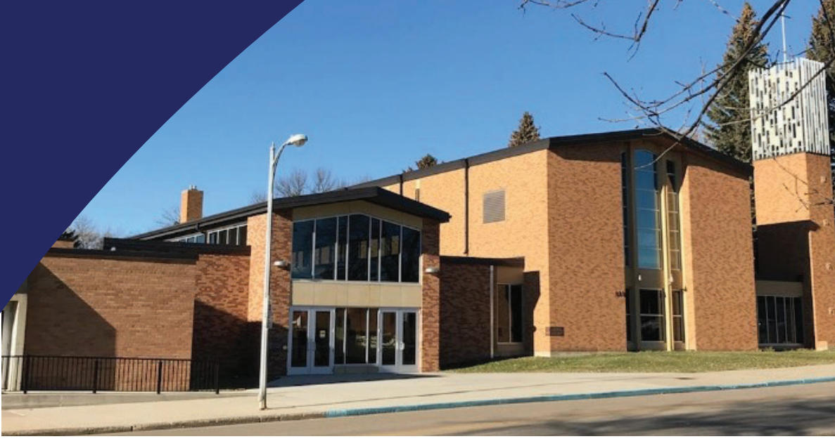
Church of St. Therese the Little Flower, Minot