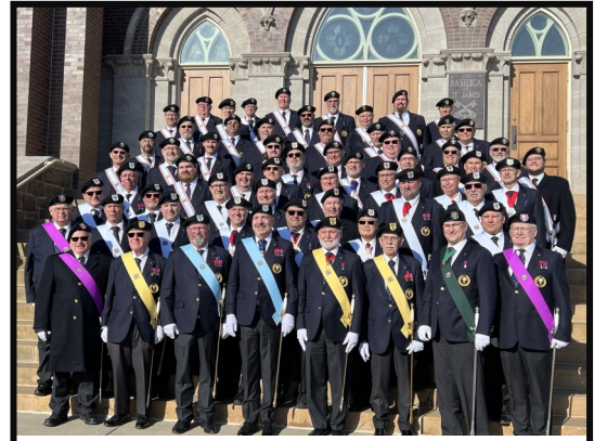
Fourth Degree Honor Guard at the Knights of Columbus State Convention