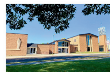
Church of St. Therese, the Little Flower